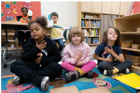
Students at Parker Wood Montessori in Cincinnati.